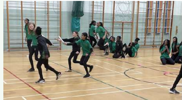
7X participating in relay during PE.